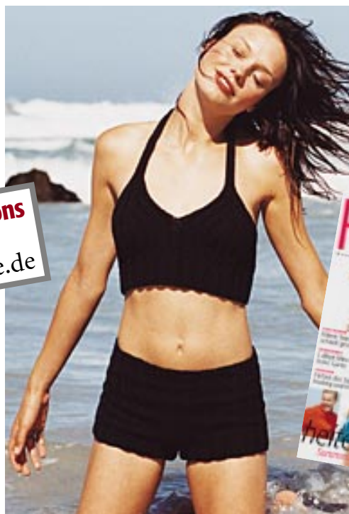
Pattern 13/14 from Rebecca 18

For Magazines and Subscriptions Phone: +49/41 01/55 38 87 E-mail: info@rebecca-online.de